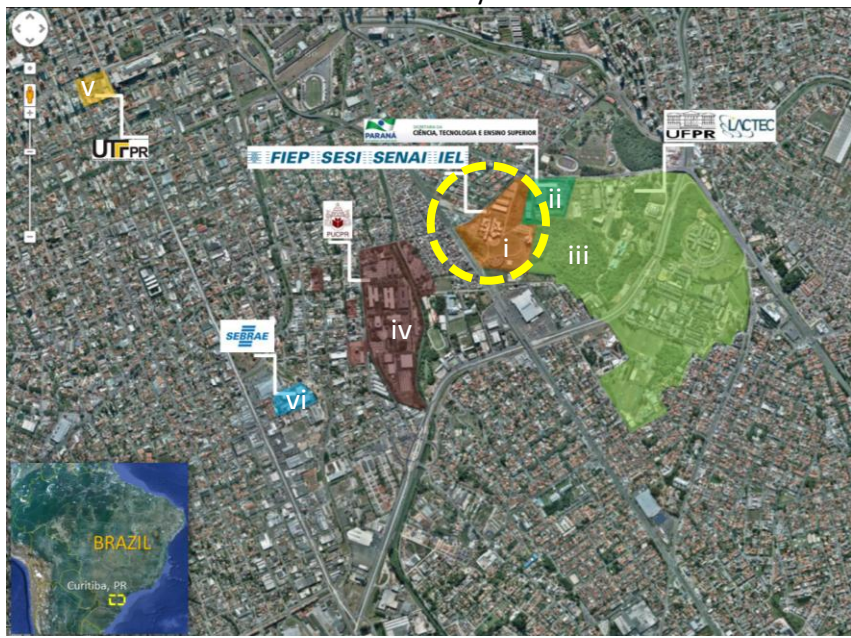
(i) Industry Campus – Fiep System; (ii) State Department of Science, Technology and higher education; (iii) Federal University of State of Paraná & Institute of Technology for Development; (iv) Pontifical Catholic University of Paraná; (v) Federal Technological University of Paraná; (vi) Brazilian Service of Support for Micro and Small Companies.

The Industry Campus, based in Curitiba, State of Paraná, Brazil, is an important unit of the System Federation of Industries of State of Paraná (Fiep, Sesi/PR, Senai/PR & IEL/PR) and is at the heart of one of the most representative innovation habitats of the country.